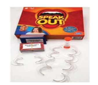
Bonus Prize Sell 5+ books to out of town friends & family on RAISY & earn a SPEAK OUT GAME