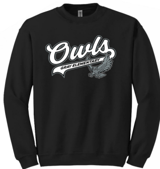
Gildan Crewneck - Black