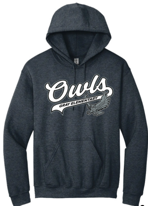
Gildan Hoodie - Dk.Heather