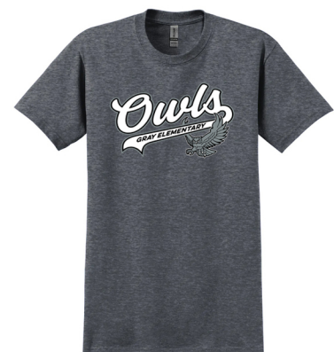
Gildan T-Shirt - Dk.Heather