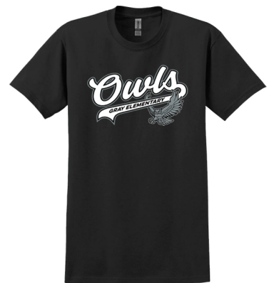
Gildan T-Shirt - Black