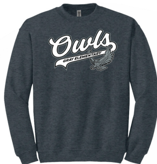
Gildan Crewneck - Dk.Heather